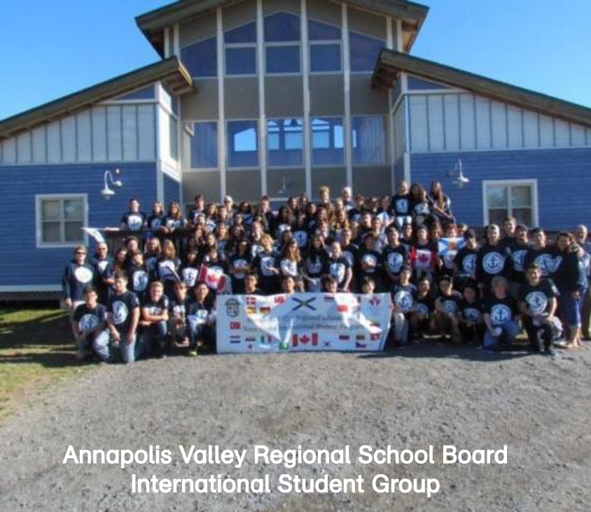
Annapolis Valley Regional School Board International Student Group