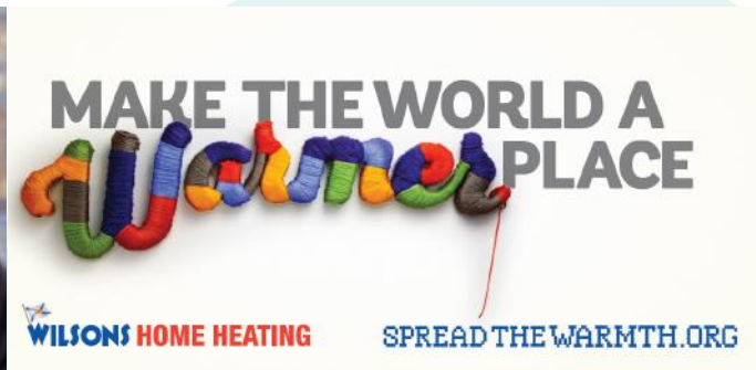
Wilson's Spread the Warmth