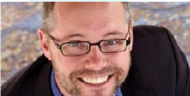
Dreamcatcher Endowment Fund

Camp BELIEVE is a brand new camp program for children who are impacted by a parent's mental illness. It is an opportunity for kids to connect with others with similar family experiences and learn healthy coping skills while engaging in camp activities. Thank you to the Mental Health Foundation Nova Scotia for making this possible for 2016 and beyond!