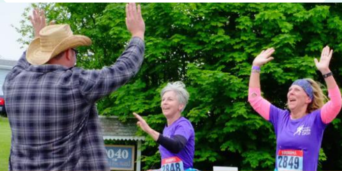
Wine & Dash

Our 2016 signature fundraiser was a record breaking event! We welcomed 457 generous participants from all across Atlantic Canada and raised just over $77,000 for Brigadoon! Thank you to Lockett's Vineyard, L'Acadie Vineyards, Gaspereau Vineyards, and Grande Pre Vineyards for hosting this event!