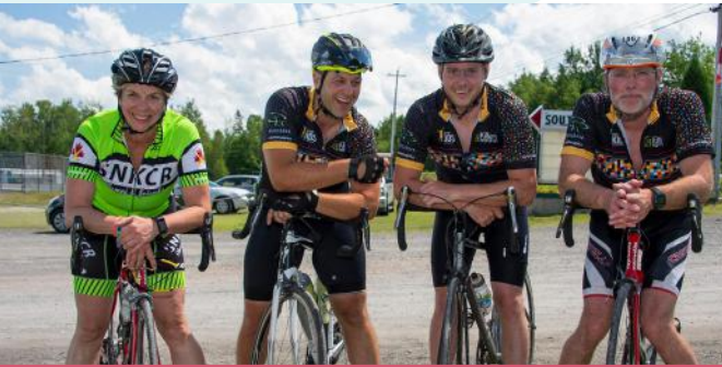
Tour For Kids

The Coast to Coast Cancer Foundation's Tour for Kids raised just over $44,000 amongst 40 participants! These determined athletes biked from Halifax to our camp facility, and back. Thank you to everyone who was involved and helped us impact the lives of children living with chronic illness, chronic conditions, and special needs!