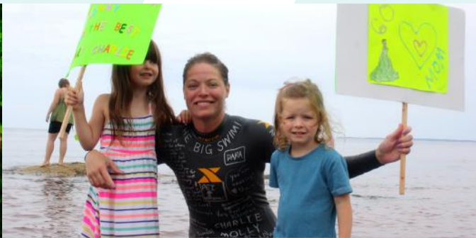
The BIG SWIM

Our 2016 signature fundraiser was a record breaking event! We welcomed 457 generous participants from all across Atlantic Canada and raised just over $77,000 for Brigadoon! Thank you to Lockett's Vineyard, L'Acadie Vineyards, Gaspereau Vineyards, and Grande Pre Vineyards for hosting this event!