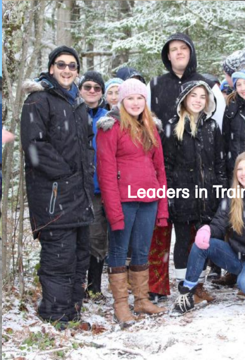
Leaders in Train