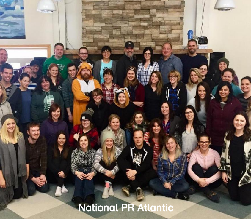
National PR Atlantic