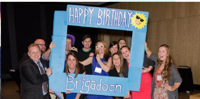
5th Birthday Celebration

In August of 2016, Brigadoon's Halifax office relocated to the historic Hydrostone Market! Our unique space is located at 5523A Young Street, Halifax, Nova Scotia, B3K 1Z7, next to Julien's Bakery. Feel free to drop by for a visit at any time!